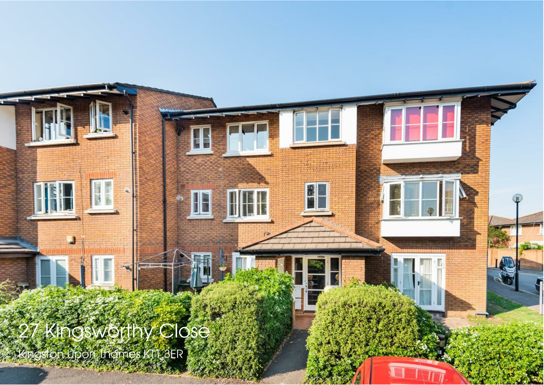
27 Kingsworthy Close Kingston Upon Thames KT1 3ER

34 Richmond Road Kingston upon Thames Surrey KT2 5ED www.gibsonlane.co.uk Tel: 020 8546 5444